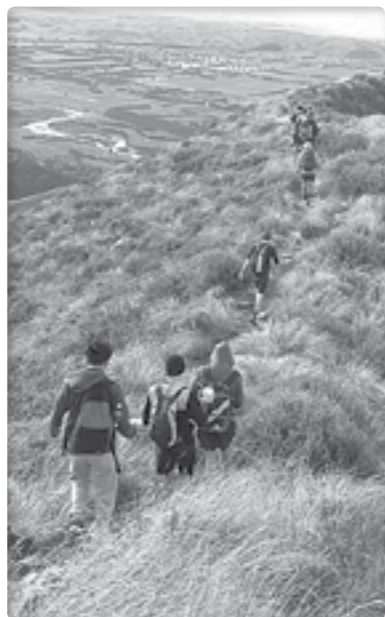
Outdoor Ed students walking down the ridgeline at Peel Forrest, during their first outing.