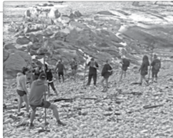
Year 13 Geography: Students undertaking their case studies, relaxing and completing work back at the accommodation, and seals observing the humans at work.