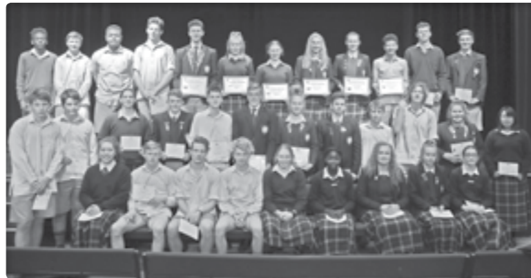
2018's Summer Sports and Cultural Colours and Blues Performance Awards recipients