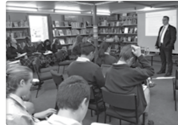
Year 11 History: Students listen to the harrowing and sombre tales of the Holocaust and its very real implications for the lives of the many left with the effects of WW2 Nazism.