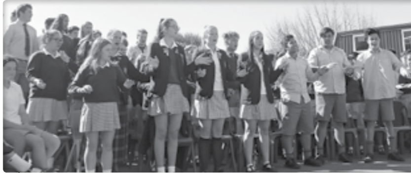
The Red House contingent.