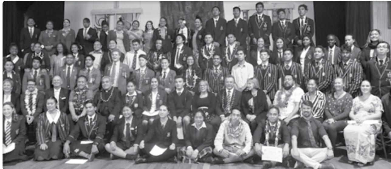
All of the Top Pasifika Academic Achievers from the Mid and North Canterbury region for 2018, as well as their Pasifika Support Co-ordinators and Principals.