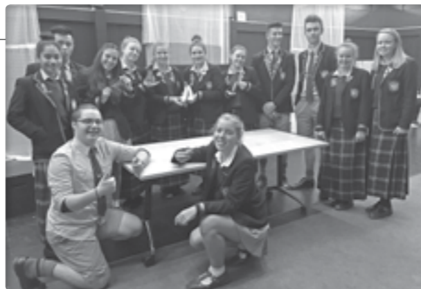
The members of the 2018 Student Exec at the beginnings of their fantastic initiative, 'Shared Morning Tea', which has provided free morning tea to anyone who wanted to come and join the Student Exec for morning tea, every day this year. The running of this through exam leave has and will continue to be kept up by the Junior Council members.