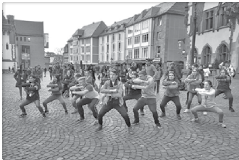
The Kiwi contingent plus some from other countries doing the Haka outside Römer.

Burnside HS combined at Burnside for a four day course centred on aspects of Mathematics all taught in German and led by tutors from the German-based Science and Maths Institute, Imaginary. Using computer programmes and creating all sorts of geometrical shapes, the students were introduced to a number of concepts and modelling. The Goethe-Institut, Wellington, was instrumental in enabling the course to run. You can check out the students' designs on Imaginary's website.