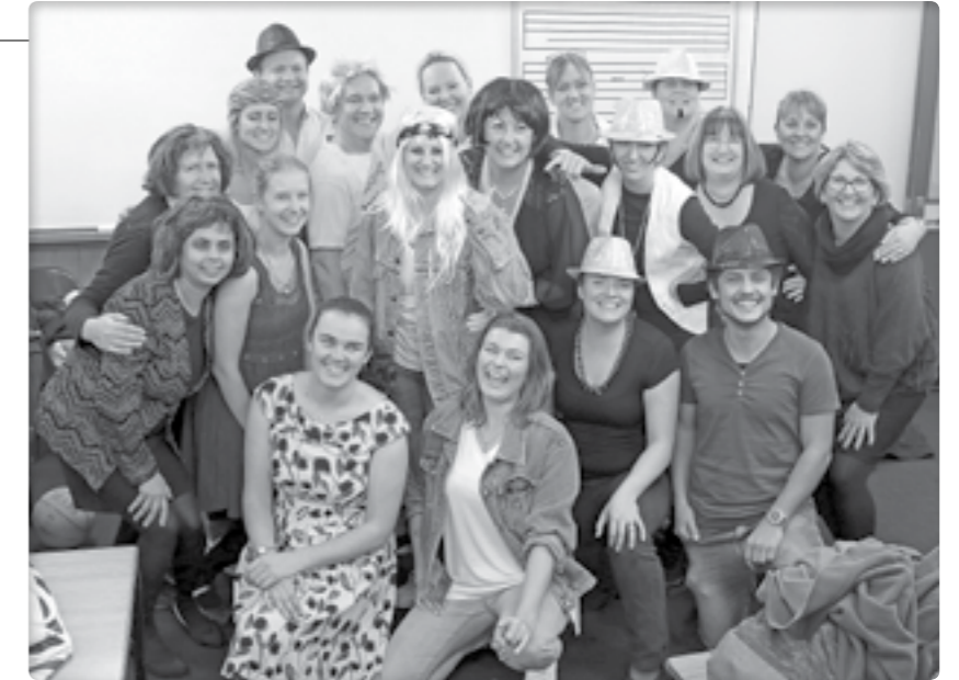
The victorious staff ensemble from this year's Staff v Student Exec, Lip Sync challenge. See if you can spot the one-armed, drummer with the luscious locks...

Throughout the year, there are often a number of memorable moments that occur outside of the classroom; not least of which include the absolute demolition of the Student Exec Lip-Sync